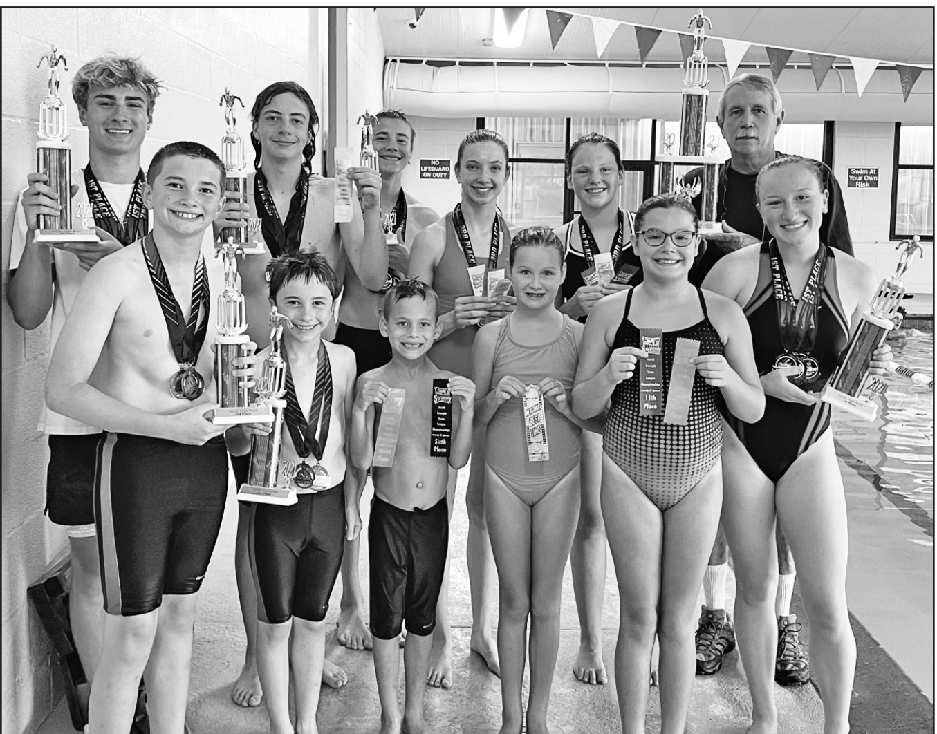
The North Georgia Rapid Swim Team are back in action this summer.

The North Georgia Rapids Swim Team, located in Blairsville, recently competed in a two-day league championship swim meet.