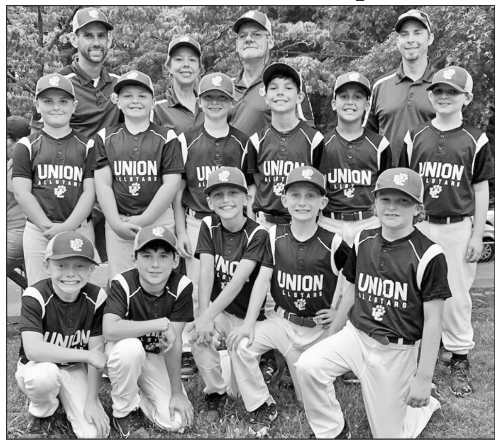
Union County's 10U baseball squad was one of two UCRD teams to finish among the top three in last month's GRPA State Tournaments.

23, the Panthers faced Long County in round one, dropping a 4-3 pitcher's duel.